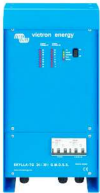
Skylla TG 24 30 GMDSS